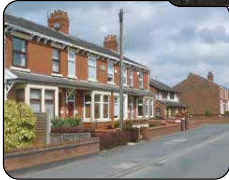
The photos are of Coronation Terrace on Wigan Road showing how they were and how they look now.

It was initially anticipated to serve as a page for people to compare and contrast old photographs of the village and share memories. However, it has developed over the years to become a great page for the community to share local news, events, stories and has even helped lost pets be returned to their owners and reunite lost friends and property.