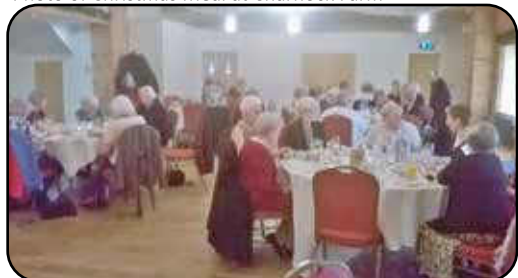
Photo of Christmas Meal at Charnock Farm